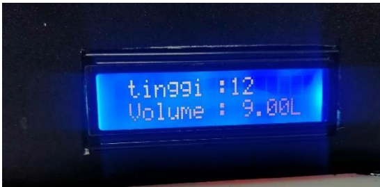
Figure 1. LCD testing

Liquid Crystal Display testing is done by testing the device by connecting the LCD with I2C and then connecting it to the pins on the Arduino uno.