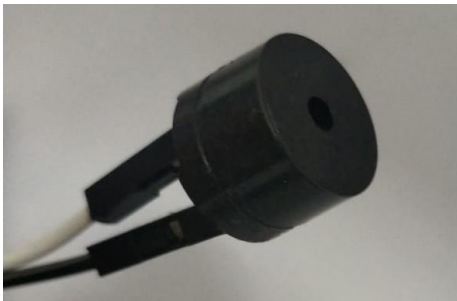
Figure 2. Buzzer Testing

Testing the buzzer lamp is carried out by connecting the anode and cathode to the buzzer pin attached to ground and a voltage of 5 Volts