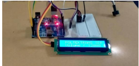
Figure 4. Overall System Testing

Overall system testing is testing carried out using all hardware and software equipment used such as Arduino Uno, LCD, buzzer, and time of light sensor. This test ensures that the data sent by the website to Arduino via the internet network can communicate with each other then the data can move the module according to voice commands made on the website.