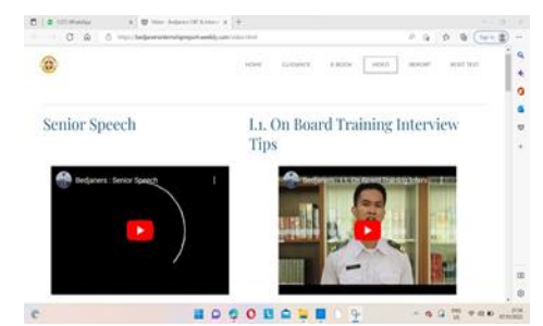
Figure 3. The materials on the applications

Inside the application is made as English learning materials during Internship with the topics: Senior Speech, Preparation for carrying out Internships (On Board Training and Internship), Tips and Interviews needed before and during the internship. This application is used as a means of training for the development of English language skills in making English language reports. Users of this application are Shipboard training ready cadet in semester III, IV, V, VI of the Deck, Engine, and Port and Shipping Study Program.