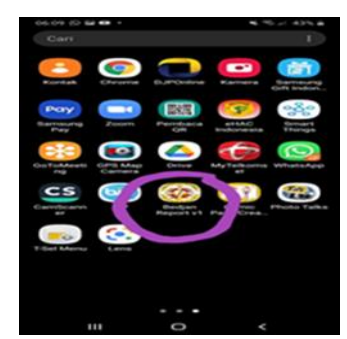
Figure 2. The application downloaded on mobile phone

Inside the application is made as English learning materials during Internship with the topics: Senior Speech, Preparation for carrying out Internships (On Board Training and Internship), Tips and Interviews needed before and during the internship. This application is used as a means of training for the development of English language skills in making English language reports. Users of this application are Shipboard training ready cadet in semester III, IV, V, VI of the Deck, Engine, and Port and Shipping Study Program.