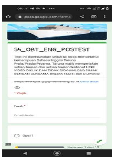
Figure 3. Post Test

Both Pre-test and Post-test are using google form inside videos and the questions from each topic of internship. Pre-test delivered to 50 cadets from 54 batch students who are doing their Shipboard training. It held on the first week of February, and the Post-Test delivered on the last of February. The test aimed to know the students' English ability. The specific achievements expected in the learning contained on this website are to increasing the student knowledge about the basic concepts of preparation for implementing "Shipboard Training/Internship" with fun, easy and communicative learning media, to increase the student knowledge about reporting in the implementation of effective Shipboard Training, and to improving the English ability in reporting. Learning Materials are conversational materials used for activities related to the implementation of Shipboard Training). The pre-test for students was conducted before they got the treatment using the