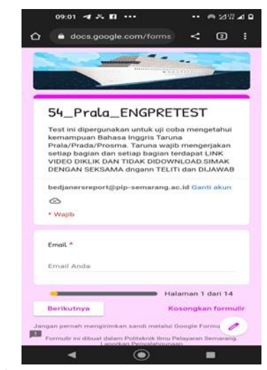
Figure 2. Pre-Test