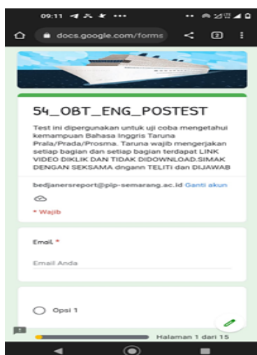
Figure 3. Post Test

Both Pre-test and Post-test are using google form inside videos and the questions from each topic of internship. Pre-test delivered to 50 cadets from 54 batch students who are doing their Shipboard training. It held on the first week of February, and the Post-Test delivered on the last of February. The test aimed to know the students' English ability. The specific achievements expected in the learning contained on this website are to increasing the student knowledge about the basic concepts of preparation for implementing "Shipboard Training/Internship" with fun, easy and communicative learning media, to increase the student knowledge about reporting in the implementation of effective Shipboard Training, and to improving the English ability in reporting. Learning Materials are conversational materials used for activities related to the implementation of Shipboard Training). The pre-test for students was conducted before they got the treatment using the