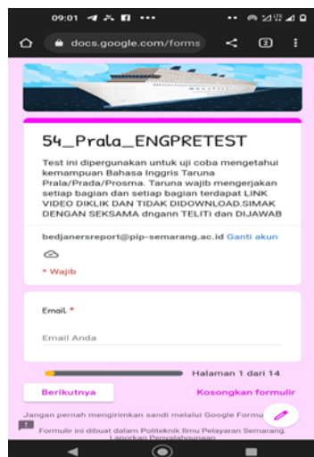
Figure 2. Pre-Test