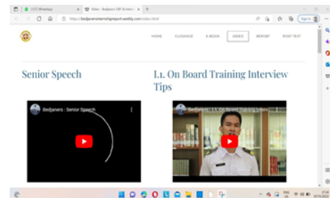
Figure 3. The materials on the applications

Inside the application is made as English learning materials during Internship with the topics: Senior Speech, Preparation for carrying out Internships (On Board Training and Internship), Tips and Interviews needed before and during the internship. This application is used as a means of training for the development of English language skills in making English language reports. Users of this application are Shipboard training ready cadet in semester III, IV, V, VI of the Deck, Engine, and Port and Shipping Study Program.